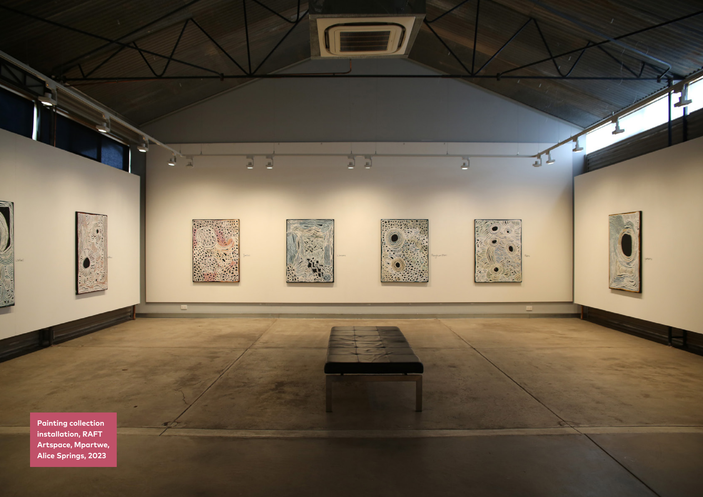
Painting collection installation, RAFT Artspace, Mpartwe, Alice Springs, 2023