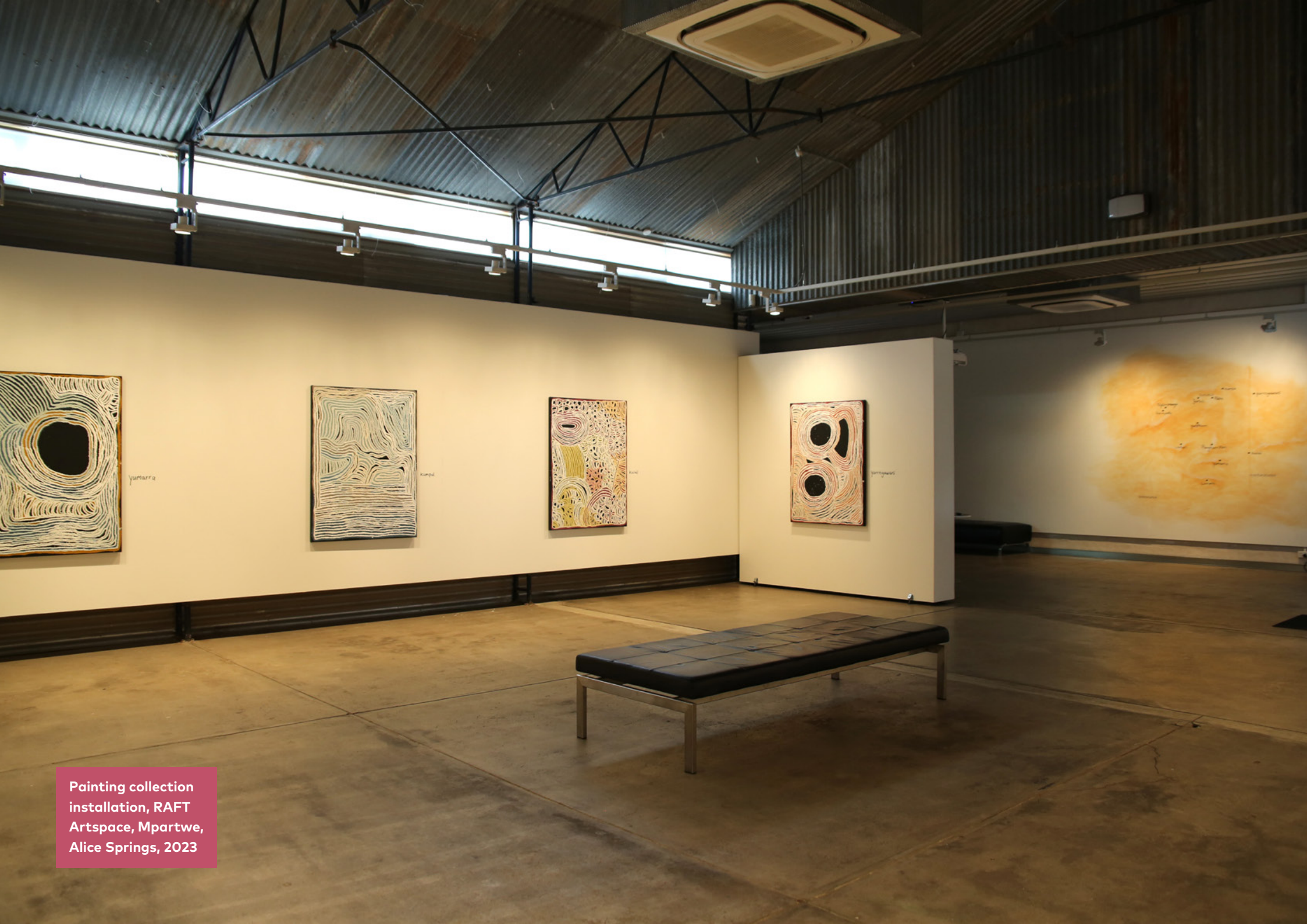
Painting collection installation, RAFT Artspace, Mpartwe, Alice Springs, 2023