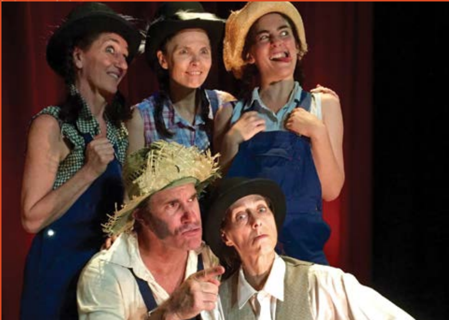
Hillbilly Horrors