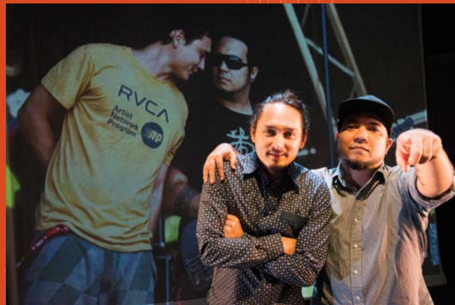
In Between Two

Stay tuned for future collaborations with Taiwanese artists and 2018 national tour dates.