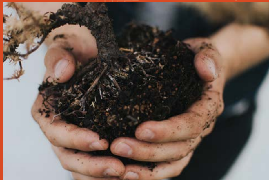
Coal Face , stock photo