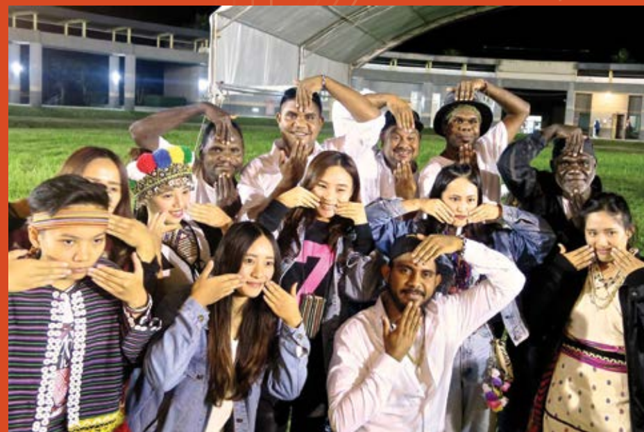
Indigenous R&B group B2M on their tour of Taiwan with students from the School of Indigenous Affairs at the National Dong Hwa University.