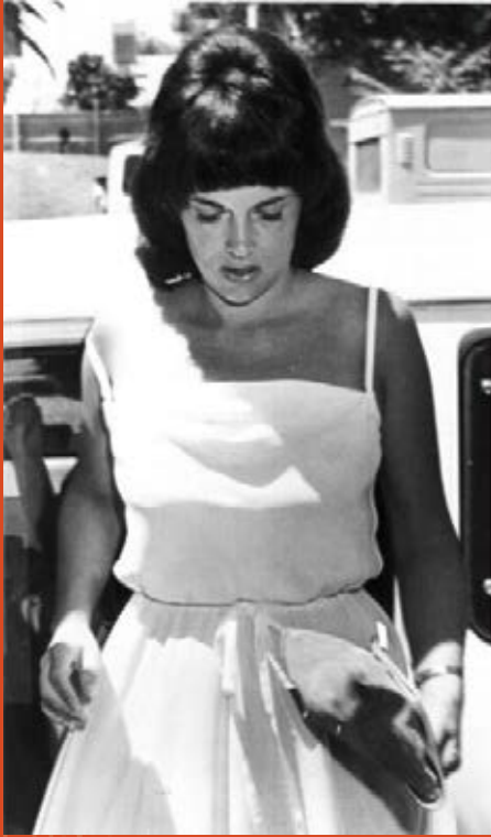
Photo of Lindy Chamberlain