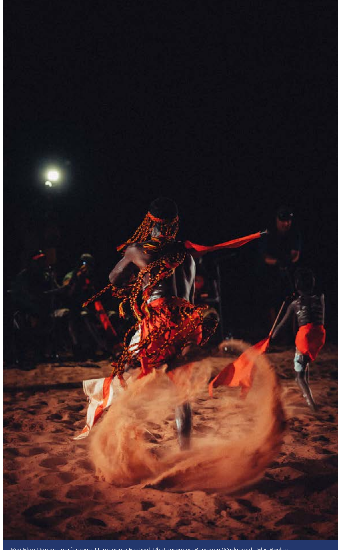
Red Flag Dancers performing, Numburindi Festival.

This new sector development opportunity commenced in 2018 with the successful attainment of the Strategic Initiatives grant from Arts NT. This grant allowed Indigenous Festival Directors to participate in an exchange program across the communities of Milingimbi, Numbulwar, Borroloola and Lajamanu.