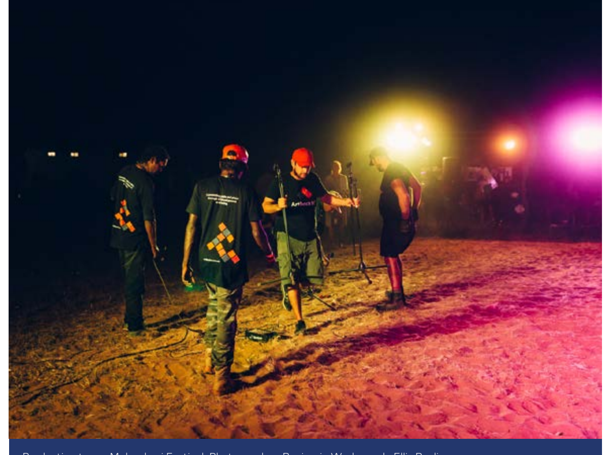
Production team, Malandarri Festival.