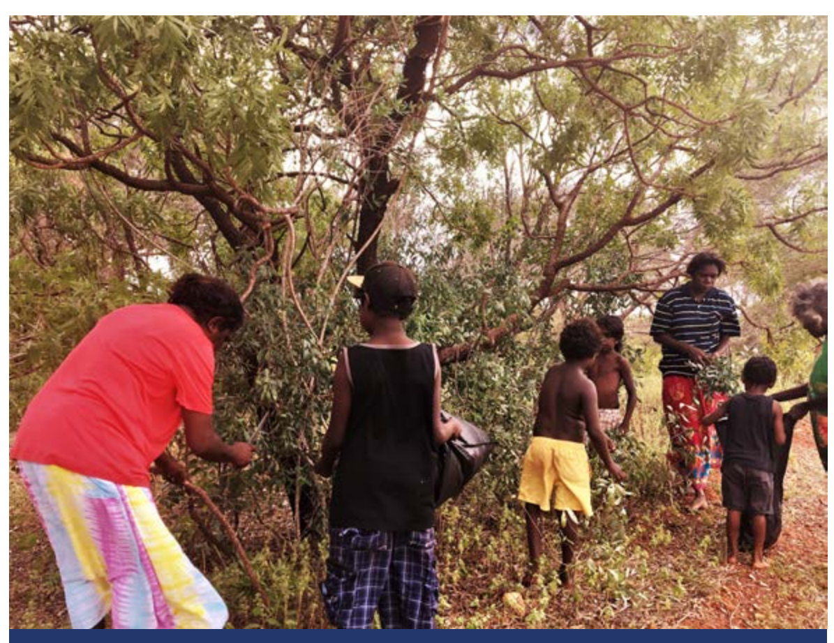
Bush medicine collection, Banarri and Dhuburrubu, Nunggarrgalu Culture Camp.